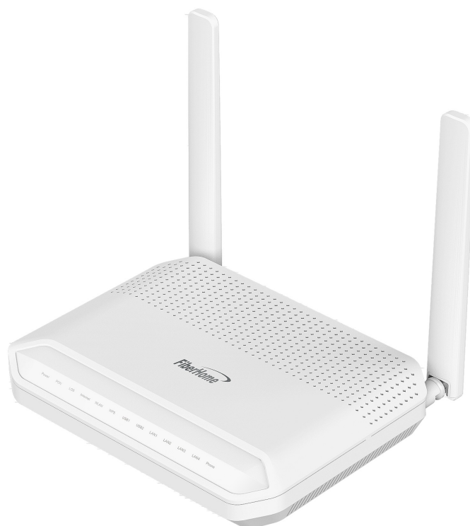
Figure 2-2 Overall Outlook of the HG6145F