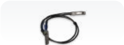
DDQ+DA0001 400G DAC, 1 m