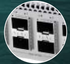
8x 50G SFP56 ports