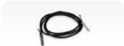
DDQ+DA00031 400G DAC, 3 m