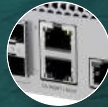
2x 1G/10G Ethernet ports

The CRS812 scales your network from 10 to 400G in one simple, affordable, yet managed RouterOS v7 box – no forklift upgrades needed!