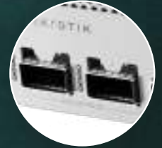
2x 400G QSFP56-DD ports