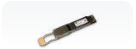
DDQ+85MP01D 400G 100 m optical transceiver

With CRS812, 400 Gigabits is no longer out of reach – it’s an affordable way to launch your network into the future, while keeping your existing gear in the loop!