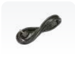
2 Power cords