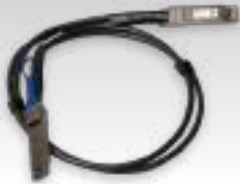
DDQ+DA0001 400G DAC, 1 m