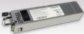
48V DC telecom-IN hot-swap power supply