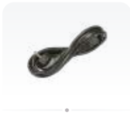
2 Power cords