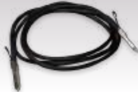
DDQ+DA00031 400G DAC, 3 m