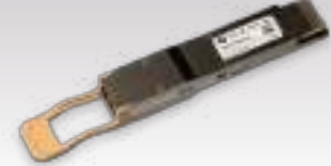
DDQ+85MP01D 400G 100 m optical transceiver