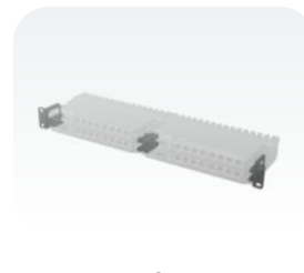
Rackmount kit K-79