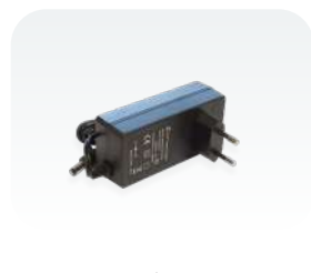
24 V 1.5 A power adapter