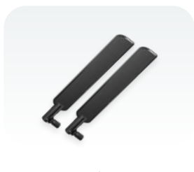
HGO indoor antenna kit