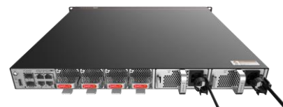
NetEngine 8000 F1A (AC)