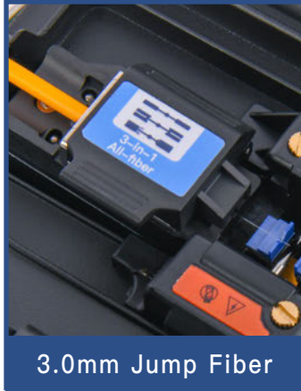
3.0mm Jump Fiber