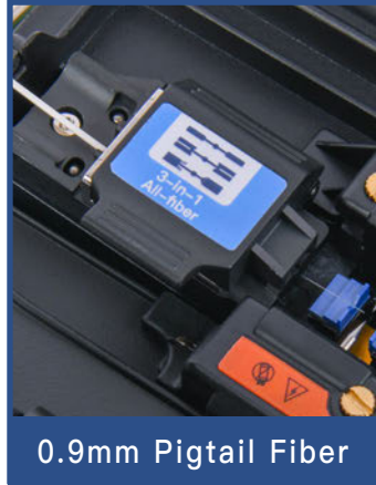
0.9mm Pigtail Fiber