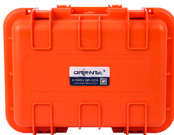
(Standard Configuration) Carry Bag