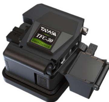
Fiber Optic Cleaver