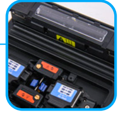
Integrated Cooling Tray