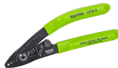
3-hole Miller Stripper