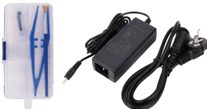
Spare Electrode+Power Charger