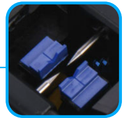
Ceramic V-groove Design