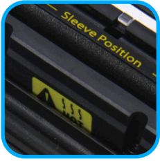
Fast-splicing 9S Fast-heating 20S