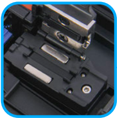
Special 3-in-1 Fiber Holder