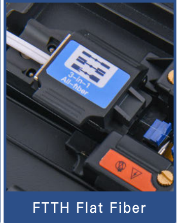
FTTH Flat Fiber