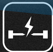
3000 Times Electrode Service Life