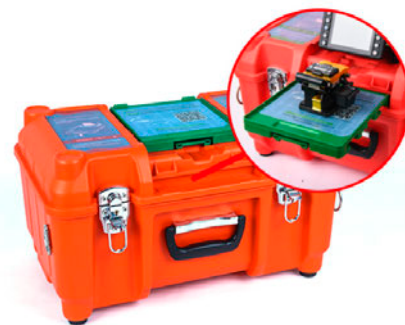
(Selective Configuration) Multi-function Carry Bag