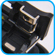
Oven with removable SOC clamps