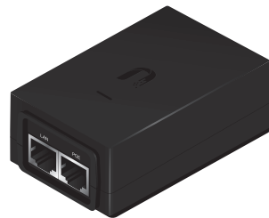
POE-24-24W POE-24-24W-G POE-24-30W