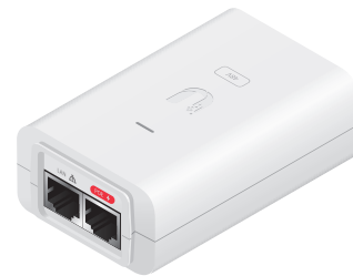
POE-24-24W-G-WH POE-48-24W-WH POE-48-24W-G-WH