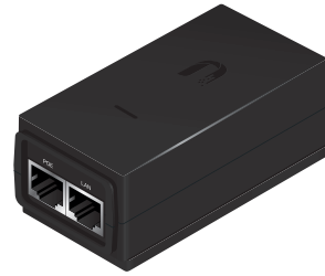
POE-15-12W POE-24-12W POE-24-12W-G