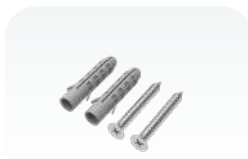
Wall mount set