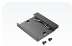
DIN rail mount set