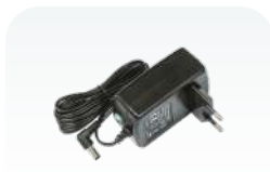
24 V 1.2 A power adapter