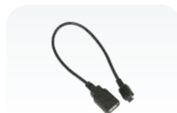
USB A Female to Micro B cable