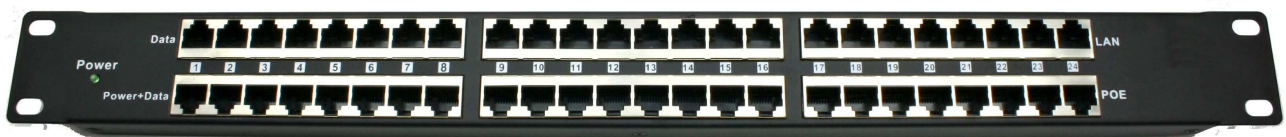
24 Port PoE Injector – 10/100 mode B