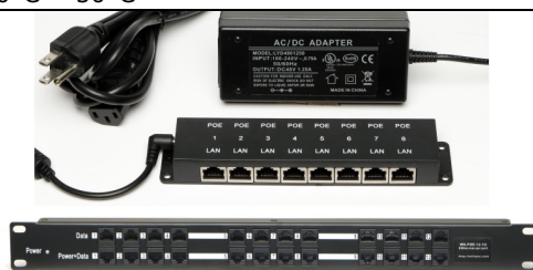
Multiport PoE passive injectors