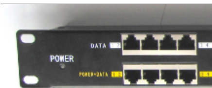
12 and 16 port rack mount 10/100mb or gigabit