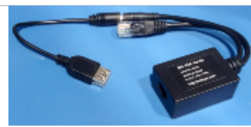
5v, USB and 12 volt active splitters